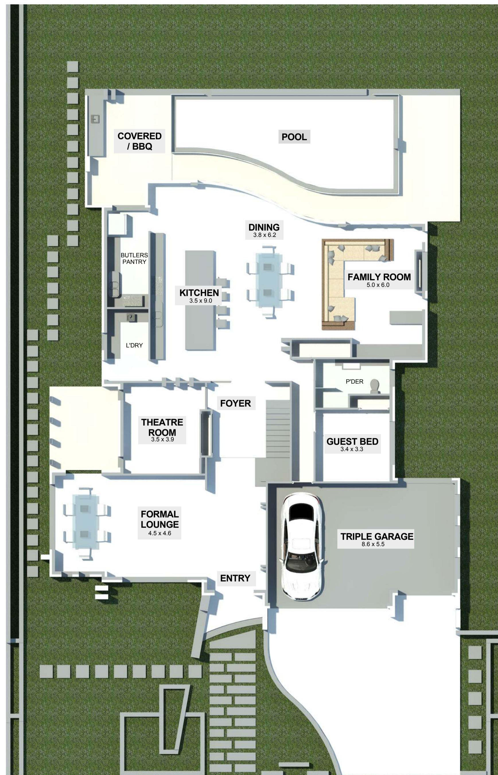
GROUND FLOOR PLAN SCALE 1:100